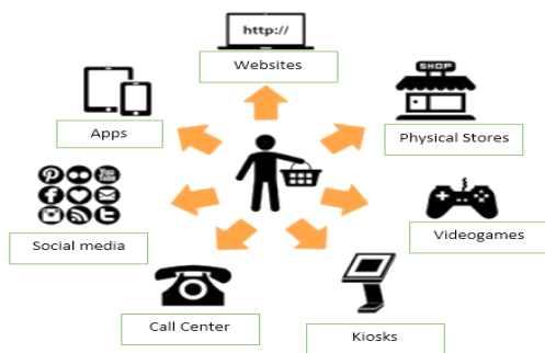
Figure 1. Schematic of Omnichannel Management over Multichannel.

A publication by ILOS (2015) shows the customer at the center of this strategy, as shown in figure 1. It demonstrates that, through the various shopping options, the customer can choose the one that suits them at the moment without having to have only the option to purchase a product, having to go to the physical store, and that the existence of different channels significantly reduces the limitations found in one or another channel, that is, it has several purchase options and not just a single acquisition channel.